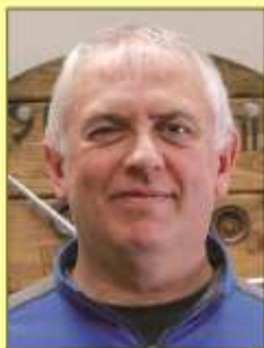
Rod Siring Vigilante Electric Dillon, MT